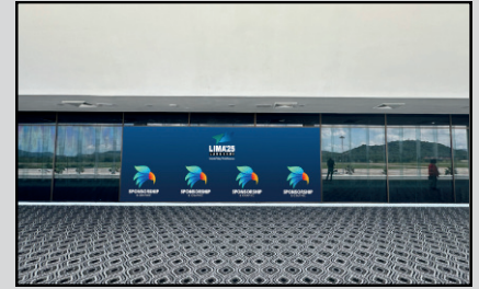
1 x Backdrop @ VIP Viewing Gallery