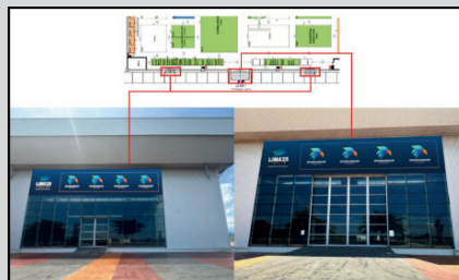
2 x Glass Panel Branding at Hall A