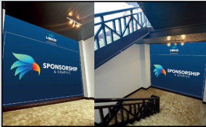
4 x MIEC Hall Level 1 & 2 Wall (Royal, PM, VIP Viewing Deck) Size: 4.4m (W) x 3.7m (Ht.)