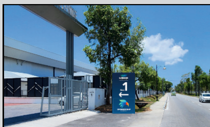
1 x Signage @ Gate 1, MIEC