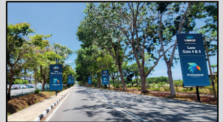
500pcs x Lamp Post Signage from Kuah until MIEC Hall