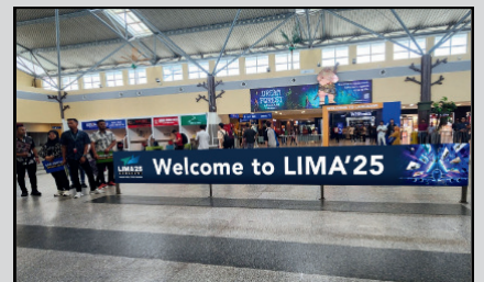
1 x Welcome Banner @ Airport Size: 7m x 0.7mH