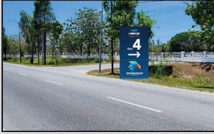
1 x Signage @ Gate 4, MIEC