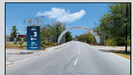
1 x Signage @ Gate 3, MIEC