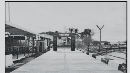
Entrance Arch at Walkway from Jetty