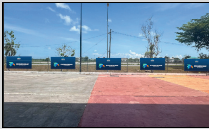
5 x Main Walkaway Advertisement (Side Fencing) Size: 3m (L) x 1.5m (W)