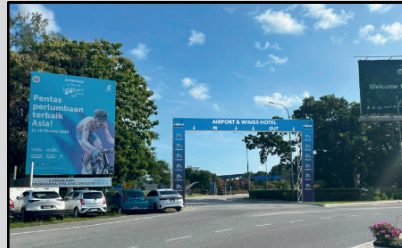
1 x Roadside Arch at Airport Roundabout Towards Airport Wings Hotel