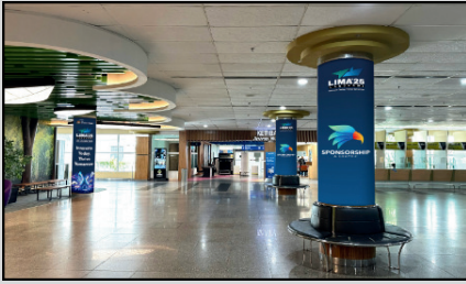
2 x Box Up Pillar @ Airport Size: 2.7m (W) x 2.2m (Ht.)