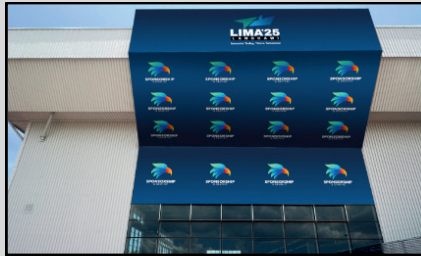
2 x MIEC Side Facade Top Graphic Size: 17m x 11mH Bottom Graphic Size: 17m x 4mH