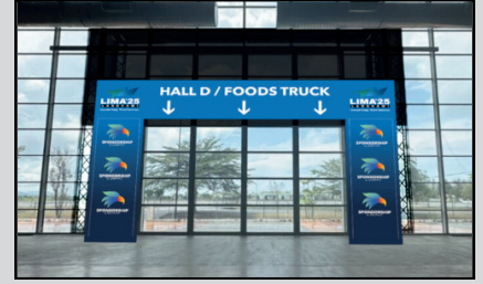
1 x Entrance Arch at Hall A (View from Inside) Size: 6m (W) x 4m (Ht.)