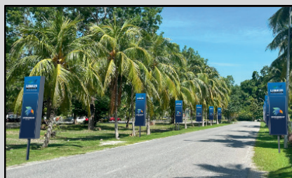
500 pcs x Bunting Along Roadside Airport, Pantai Chenang, Pantai Tengah towards Resorts World Lobby