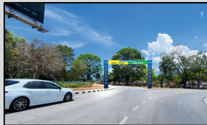
1 x Roadside Arch at Airport Roundabout towards MIEC Hall