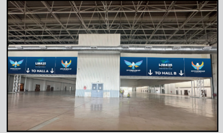
4 x Advertisement on Walls - Hall A and C Size: 6m (L) x 3m (W)