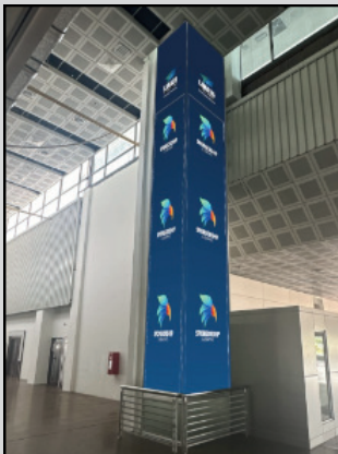
2 x MIEC Hall Lift Banner Size: 1.5m x 9.8mH