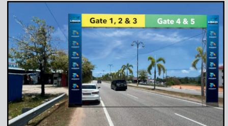
1 x Roadside Arch 1 (From Kuah Town towards Airport/MIEC Hall)