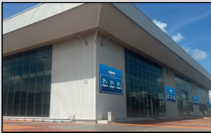
4 x Giant Buntings at The Main Building Size: 6m (Ht. x 5m (W)