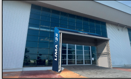
1 x Awning entrance at Hall A (View from Outside) Size: 9.5m (W) x 10.8, (Ht.)