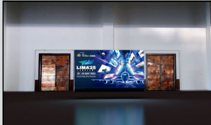
1 x Huge LED Screen @ Entrance of Ballroom