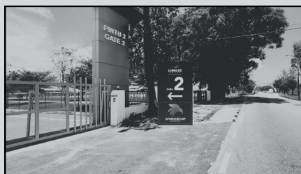
1 x Signage @ Gate 2, MIEC