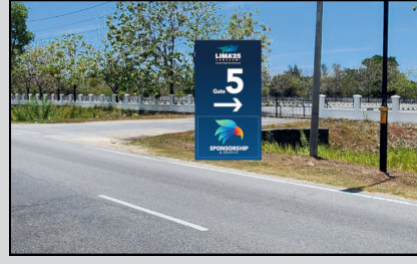
1 x Signage @ Gate 5, MIEC