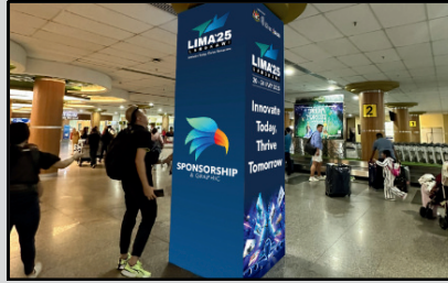
1 x Box Up Pillar @ Airport Size: 1m (W) x 3m (Ht.)