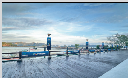
40 x Bunting & Banner at Resorts World Side Deck