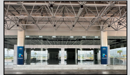
2 x Main Entrance Pillar Wrap