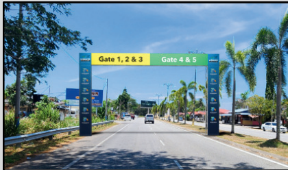
1 x Roadside Arch 2 (Toward Resort World Maritime Side)